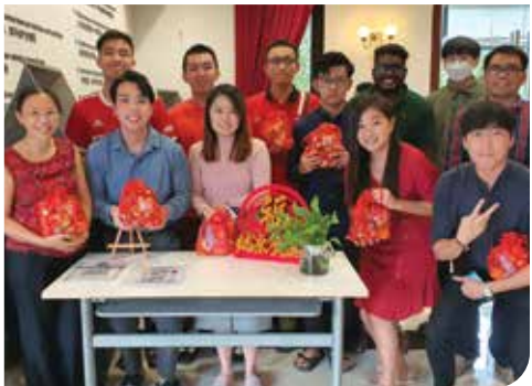
Exchange of gifts during Chinese New Year celebration in January 2023.