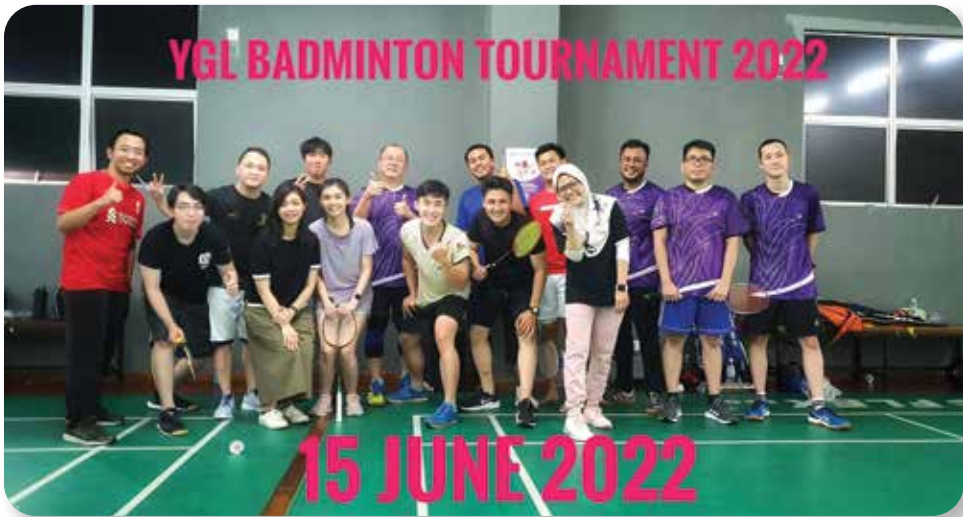
Ygl's internal "Badminton Tournament" held on 15 June 2022 in Kuala Lumpur.

It is our people who drive the success of Ygl's business. Ygl engages its employees in various activities to foster teamwork and unity in line with its policy of diversity and inclusiveness.