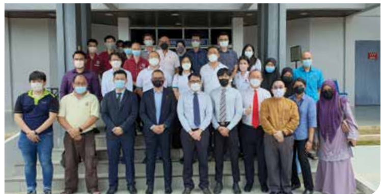
Demonstration of AGV machine at Bertam, Kepala Batas seminar.