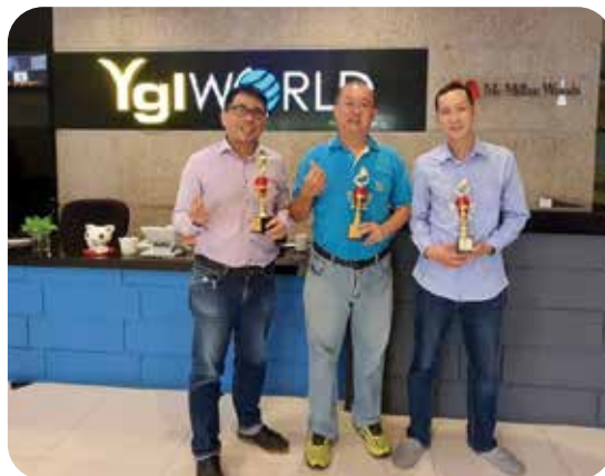
Our Badminton champions.

The Company held a highly anticipated "Badminton Tournament" on 15 June 2022 in Kuala Lumpur ("KL") to bring together the Penang and KL employees. This sporting event allowed the employees to showcase their badminton prowess and bolster camaraderie and unity among them. The Penang team emerged as the winner and together with the KL team put up strong sportsmanship and teamwork.