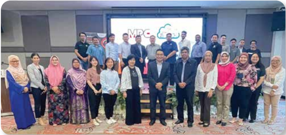
Participants at the "Reflection Session on MyRESKILL IoT by MPC".