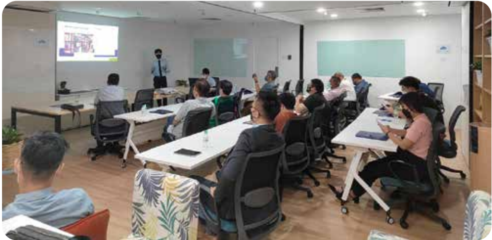
Attentive participants during the KL seminar.