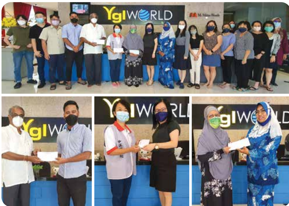
Ygl organised a special coffee session on 28 June 2022 and shared the proceeds from the sales of coffee with a fundraising theme.

We are grateful to “PERTUBUHAN KEBAJIKAN NASYIATUL AISYIYAH”, “PURE LOTUS HOSPICE OF COMPASSION” and “PENANG HINDU ASSOCIATION” for the opportunity to contribute to the community through our “Circle of Love” campaign which raised fund from our employees and customers through our coin box and coffee.