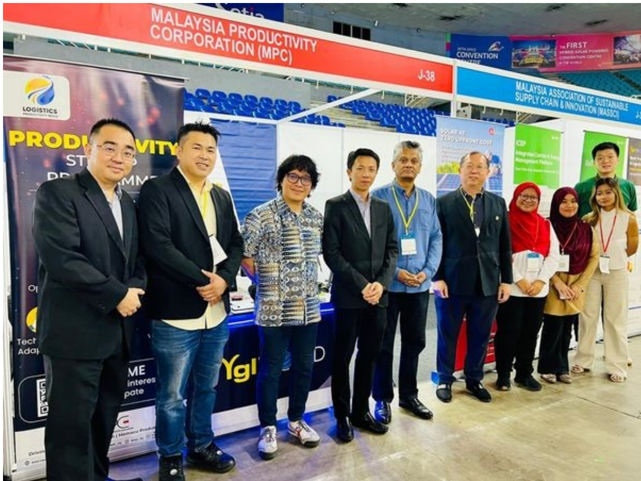
The Small and Medium Enterprises Association (SAMENTA) Malaysia Northern Region explored the offerings at the YglWORLD booth (J-24) and the MPC booth (J-38).